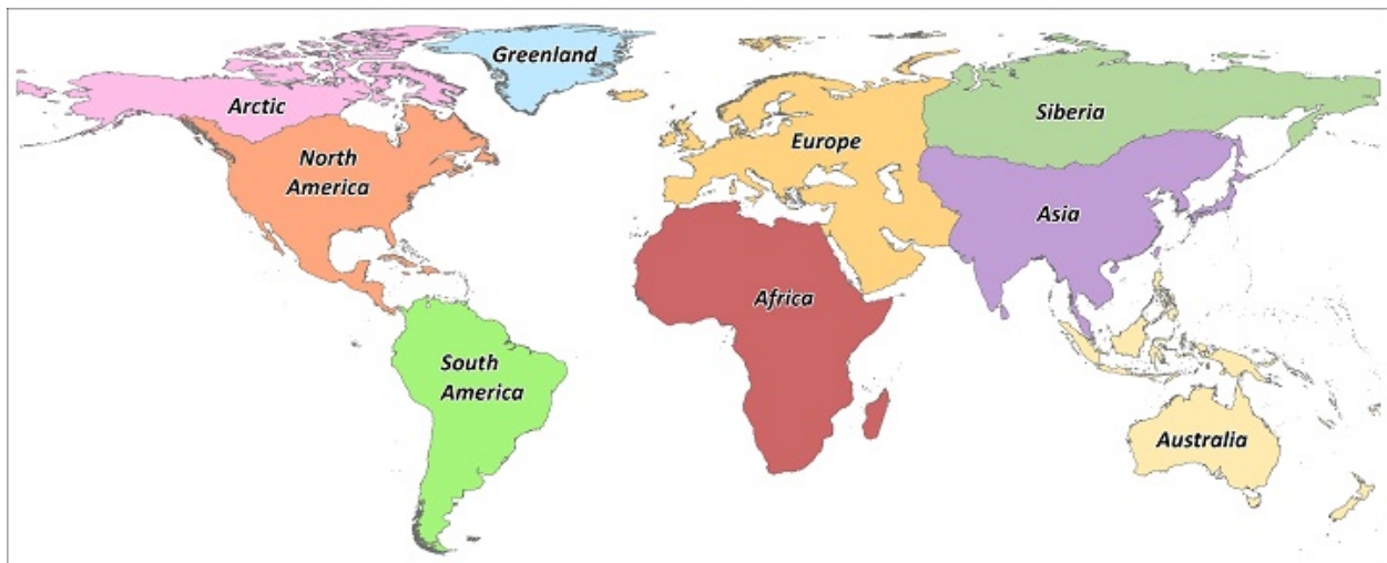
Figure 2: Spatial extent of regional tiles of HydroRIVERS data files.